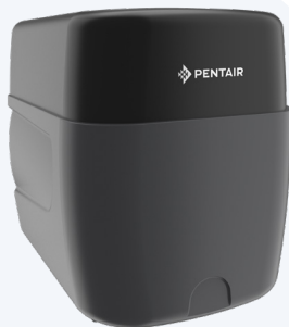
16-gallon atmospheric tank