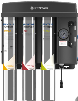
EZ-RO 650/16ATM wall mount