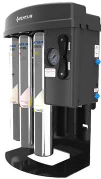
EZ-RO 650/16ATM with optional floor stand bracket