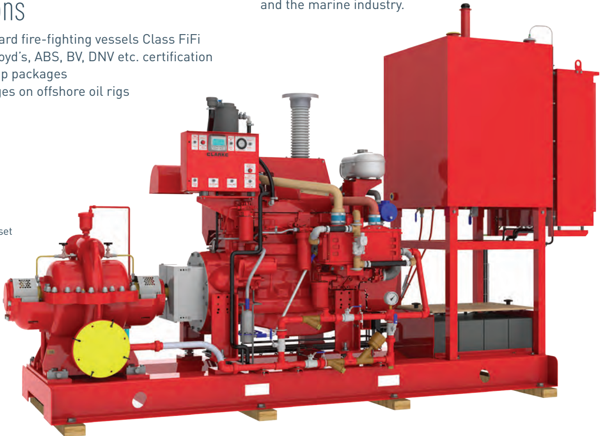
Diesel driven pump set