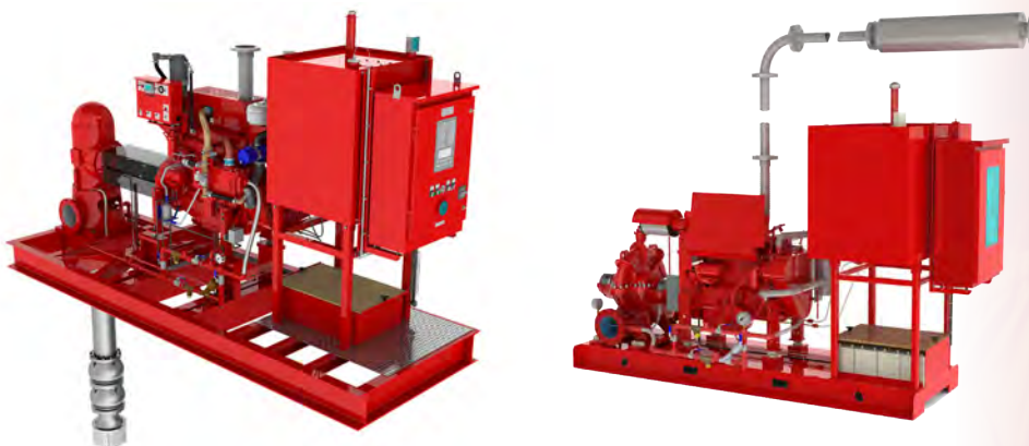
Typical Pump for an Offshore Rig

Every pump is subjected to a thorough inspection and a series of tests to ensure that it meets the required specifications before leaving the factory.